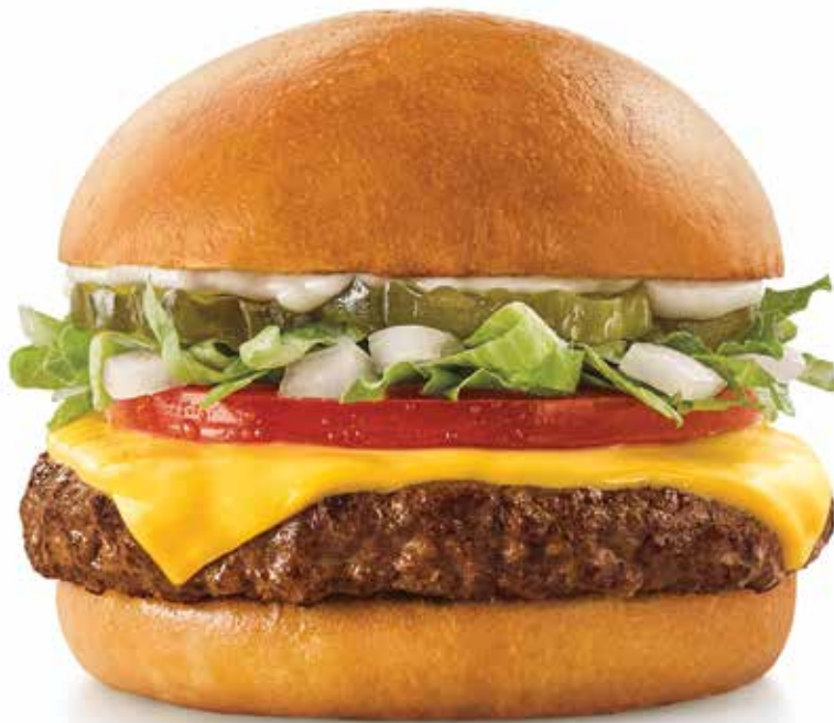
Drive-in restaurant chain Sonic introduced Sonic Signature Slinger burgers, which start at under 350 calories thanks to a formulation that blends mushrooms with beef.

retail prepared meals (FMI 2018a). With Millennial parents spending 49% of their food dollars on specialty foods, upgrading family and kid-specific prepared food offerings is very important (SFA 2018).