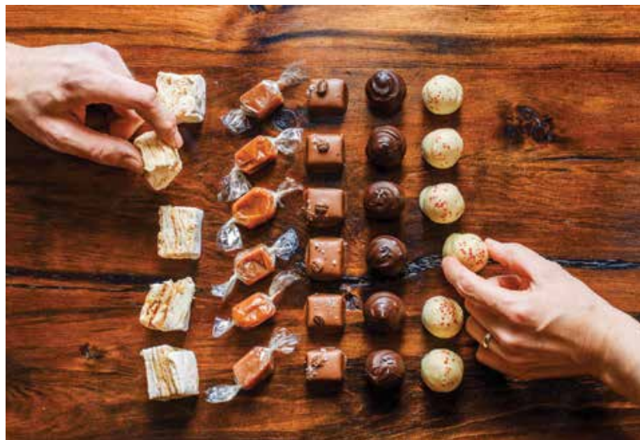
Despite high interest in healthful eating, consumers continue to have a sweet tooth. Artisan confections from Katherine Anne Confections are made using fair trade cocoa.

Households with children eat breakfast on average 5.5 days a week as a family (FMI 2017). Cereal is