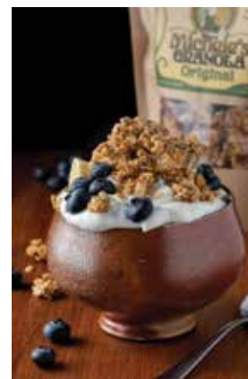
Handmade in small batches in a bakery that is 100% powered with wind power, Michele's Granola comes in an Original variety as well as more exotic varieties such as Lemon Pistachio, Almond Butter, and Cherry Chocolate.

Women are more likely to purchase all sweet snack varieties except for pie. After cookies and brownies, the next favorite sweet choice for those aged 18–24 and 45 and older is candy; those aged 25–34 favor cake and candy equally (Smuckers 2018c). »»