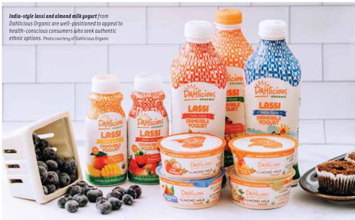
India-style lassi and almond milk yogurt from Dahlicious Organic are well-positioned to appeal to health-conscious consumers who seek authentic ethnic options.

The U.S. population continues to diversify. In 2017, 61% of adults were white, 18% Hispanic, 12% African-American, and 6% Asian American (U.S. Census 2018).