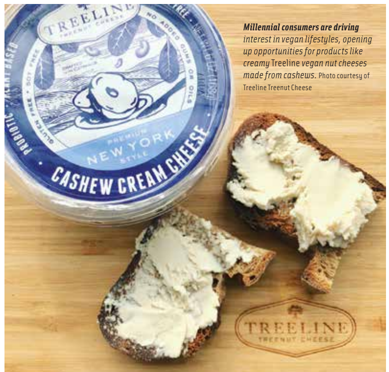
Millennial consumers are driving interest in vegan lifestyles, opening up opportunities for products like creamy Treeline vegan nut cheeses made from cashews.