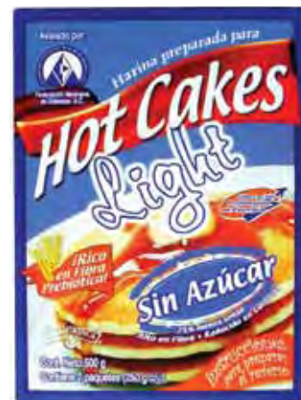
La Morisca Light Hotcake Flour, sold in Mexico, is rich in fiber and prebiotics.

Heart, digestive, and brain health are the top condition-specific claims associated with spreads/oils worldwide, according to Innova. In