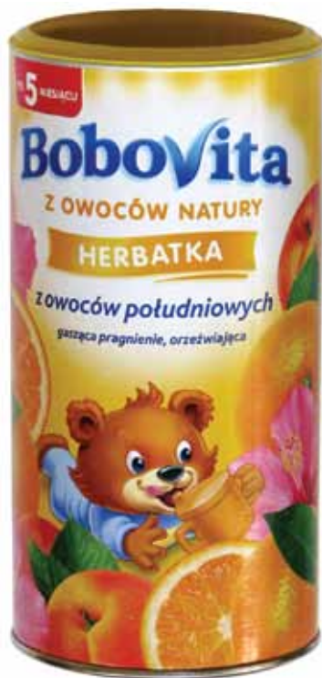
Polish babies 5 mo of age and older may enjoy this fruit-flavored instant tea beverage.

Nestlé Ice Cream Pops are bite-sized, chocolate-covered vanilla ice cream “beans” sold in the Philippines. In Europe, Nestlé’s Nesquik Flipz! Chocolate Dairy Dessert with Chocolate Sauce comes in little pots—which invert for a very