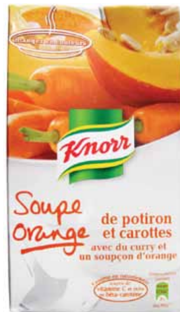
Ready-to-heat Knorr Orange Soup is rich in beta-carotene and a natural source of vitamin C.

Quince, chimichurri, camu camu, maple syrup, barbaocoa, cloud-berry, sea salt, gold kiwifruit, yacon,