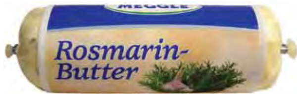
Available in Germany, Rosmarinbutter is made with fresh rosemary.

finding their way into pasta and are being added to frozen ready meals.