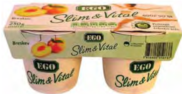
Ego Slim & Vital peach yogurt , available in Slovenia, is formulated with coenzyme Q10 and L-carnitine.

spreads; high-magnesium milk; and products fortified with omega fatty acids, coenzyme Q10, plant sterols, gamma aminobutyric acid (GABA), and phytochemicals such as anthocyanins remain among the emerging trends. In the UK, Optifit Cholesterol (with a name designed to communicate its function) is a cholesterol-reducing, multi-fruit yogurt drink with added plant sterol esters; in Spain, Gullon Active Glucanos Exquisite Cookies contain beta-glucan from oats to help regulate cholesterol.