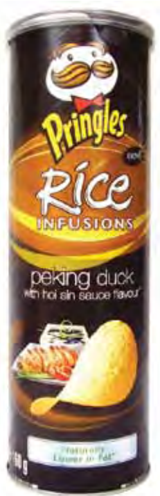
Pringles puts an unconventional twist on chips in the UK with flavors like Peking Duck with Hoisin Sauce.

Strawberry & Morello Cherry Compotes , which are marketed in Ireland and the UK.