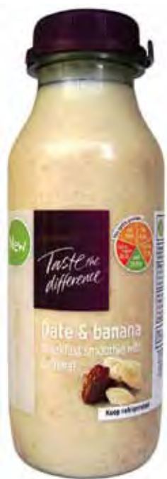
Sainsbury's Taste the Difference smoothie made with date, banana, and oatmeal truly is breakfast in a bottle.

The natural trend in beverages continues to spiral. More than 1,000 soft drinks launched globally in the year ending in March 2009 were positioned with a “natural” claim, according to Innova. While activity is dominated by bottled water and fruit drinks, there is some spillover into natural carbonated beverages with the use of all-natural flavors, as well as a return to natural sugar rather than artificial sweeteners or high-fructose corn syrup. In Taiwan,